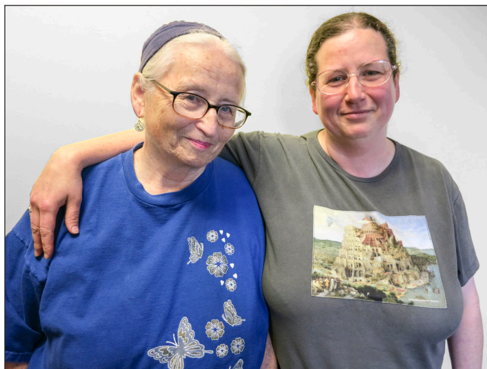
Participants after their interview session at Multnomah County Library in Portland, Oregon.