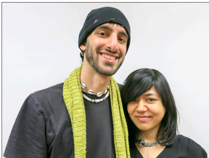
Participants after their interview session at the Sommerville Public Library in Somerville, Massachusetts.