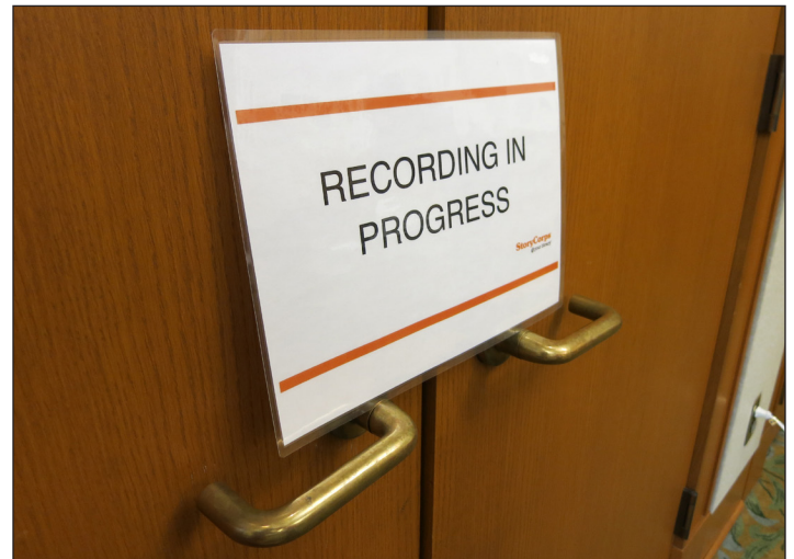
Make sure to let those around you know that an interview is taking place!