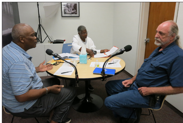
Participants talk before their interview at Tampa-Hillsborough County Public Library System in Tampa, Florida.

For more suggested questions, visit storycorps.org to use our online Question Generator , or see the Great Questions List in our Resources & Tools section. Alternately, you can create customized questions based on your own interests or program theme.