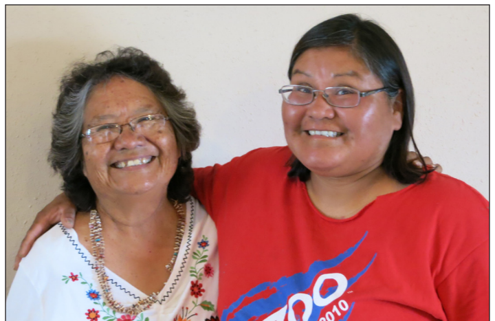
Volunteer Facilitator interviews community member at Octavia Fellin Public Library in Gallup, New Mexico.