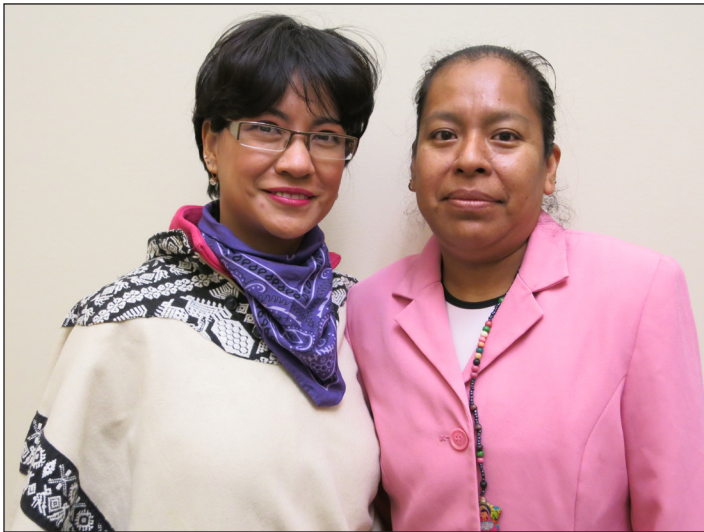
Participants after their interview session at Nashville Public Library in Nashville, Tennessee.

Audacity features instructions and tips for downloading, installing, and using their free audio editing software at www.audacity.sourceforge.net .