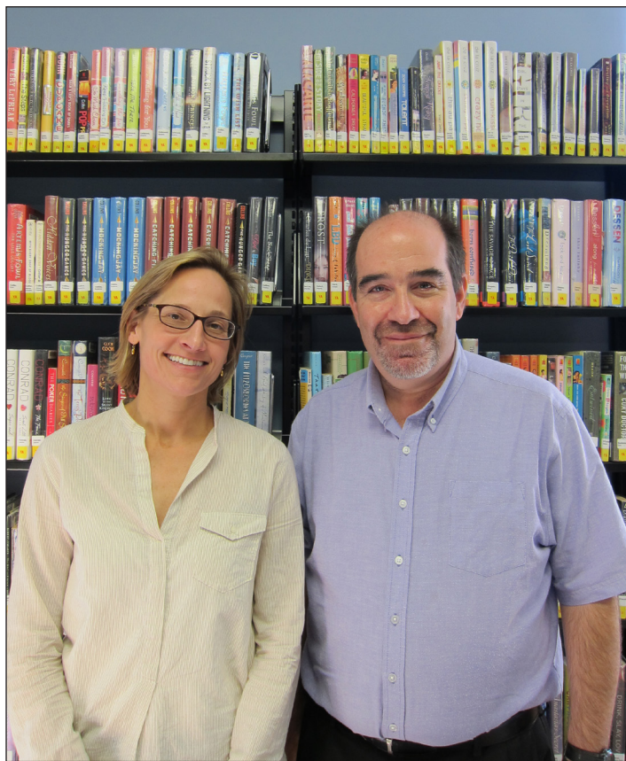
Library staff and volunteer Facilitator at Somerville Public Library in Somerville, Massachusetts.

StoryCorps interviews are a personal and effective way to share your community’s voices at board meetings, fundraising events, or conventions. It is a great way to raise awareness using different media resources.