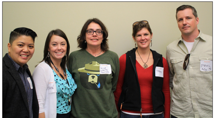
StoryCorps @ your library training at Nashville Public library in Nashville, Tennessee.

StoryCorps interviews have been cataloged in MARC (see the collection at the La Crosse Public Library), presented in ContentDM (Maryland Digital Libraries, Nashville Public Library, Denver Public Library), and incorporated in EAD Finding Aids (University of Texas – Austin).