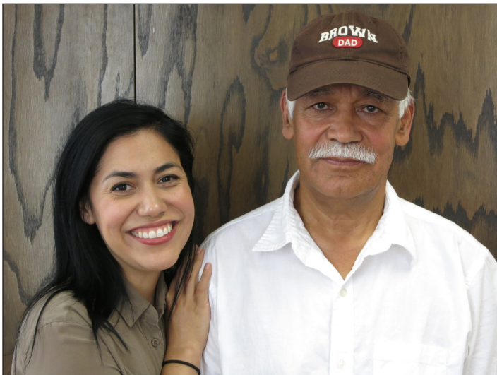
Father and daughter interview each other at Chicago Public Library in Chicago, Illinois.

For more information about checksums, please visit the online resource Oral History in the Digital Age: http://ohda.matrix.msu.edu/2012/06/resource-tutorial-on-checksum-for-digital-preservation-of-oral-history