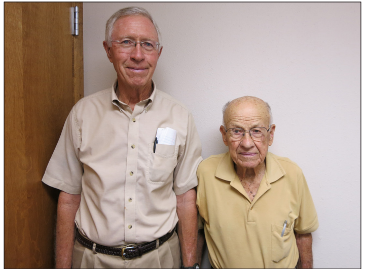
A nephew interviews his uncle about his military career at Smithville Public Library in Smithville, Texas.