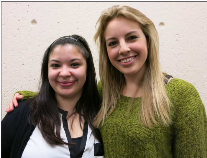
Students from DePaul University serve as volunteer Facilitators for Chicago Public Library's StoryCorps @ your library program.

The community of Smithville, Texas, previously partnered with StoryCorps to record and preserve the stories of post-9/11 veterans, active-duty service members, and their families, as part of the Military Voices Initiative. When the Smithville Public Library was selected as an SCL pilot library, it allowed the library to continue to record the stories of veterans, expanding upon the previous work done by StoryCorps and strengthening the library's ties to its community. In the midst of their program, Smithville Public Library hosted a listening event on Veterans Day that featured StoryCorps broadcasts and animations alongside the stories of veterans collected through their SCL project. After hearing some of the recordings and seeing some of the StoryCorps animations, program attendees were encouraged to schedule their own interviews with the library.