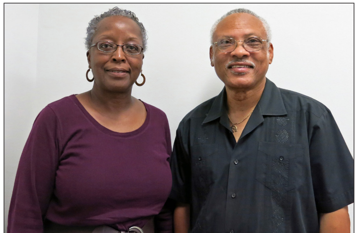
Library staff member interviews patron at Tampa-Hillsborough County Public Library System in Tampa, Florida.

StoryCorps, the Library of Congress, and many other institutions that archive oral histories or personal narratives also offer individuals the opportunity to remove their materials from the archive retrospectively. We do not present this option up front (otherwise we'd be overwhelmed with people changing their minds), but because of the often emotional content of the stories and the fact that Participants discuss the stories of other friends, family members, and colleagues we employ a liberal takedown policy and comply with all requests to withdraw an interview from the collection.