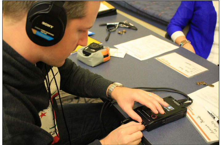
Volunteer Facilitator performs a soundcheck during the StoryCorps @ your library training at the Nashville Public Library in Nashville, Tennessee.