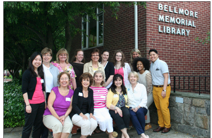
StoryCorps staff and volunteers at Bellmore Memorial Library in Bellmore, New York.

We invite you to share your experiences using this guide to present SCL programs by emailing publicprograms@ala.org .