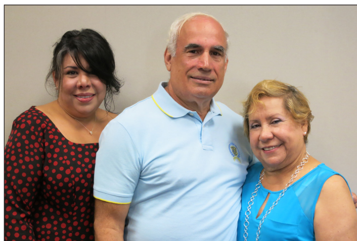
A family shares their story of "Leaving Home" at Greensboro Public Library after their interview session in Greensboro, North Carolina.

In conjunction with their "One City, One Book" program, Greensboro Public Library used their book selection, "Into The Beautiful North" by Luis Alberto Urrea, to reach multiple audiences. Using the theme of "Leaving Home," the Greensboro Public Library gathered the voices of first-generation college-bound students, elders entering assisted living facilities, recent immigrants, and African Americans who participated in the Great Migration.