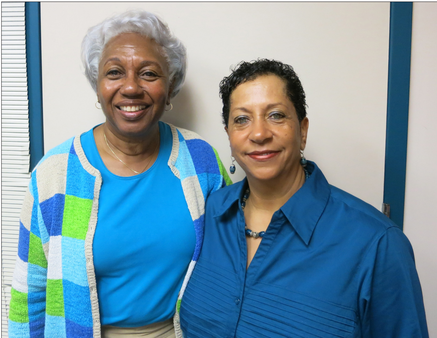
Participants at Greensboro Public Library after their interview session in Greensboro, NC.