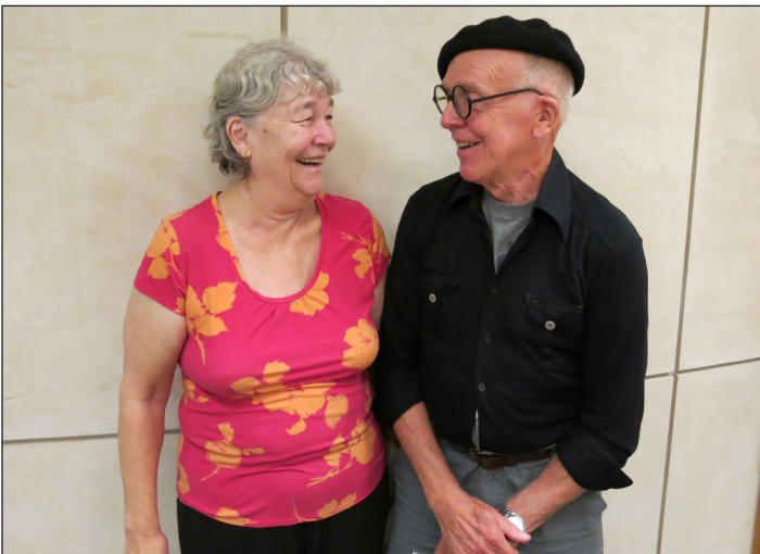
Participants after their interview session at San Francisco Public Library in San Francisco, California.

Once the recording is finished, provide Participants with a copy of the interview and their photos. You can also give the Participants a certificate commemorating their participation. Sample certificates are in the Resources & Tools section.