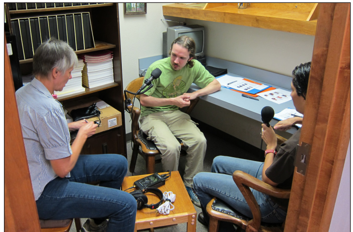
Facilitator sets up equipment during the StoryCorps @ your library training at Smithville Public Library in Smithville, Texas.